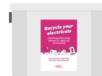
Pop up bring banks based on 145 L box