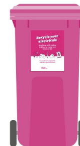
Plastic wheelie bins – 240 L