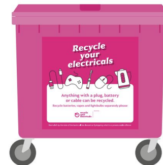
Plastic wheelie bins – 1100 L

Choose locations which are easy to find, accessible for people dropping off recycling, and with access for external collection (check with your waste management partner/local council if you're unsure)